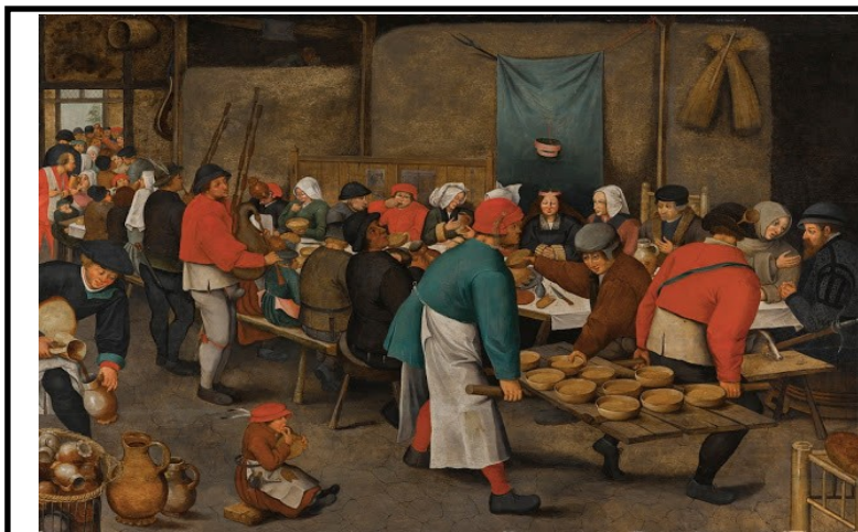
The Wedding Feast—Pieter Brueghel the Younger (1564–1638)

PLEASE TAKE THE BULLETIN WITH YOU— IT CANNOT BE REUSED.